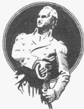
POLONUS PHILATELIC SOCIETY

WOUNDED AT SAVANNAH DIED OCTOBER 11, 1779