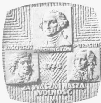
Polonus Bicentennial Medallion

Three different cacheted covers, one for each day of the show are being offered. Special Polish Polpex covers, bearing Poland's U.S. Bicentennial stamps, prepared by "Polski Związek Filatelistów" in Warsaw will also be offered.