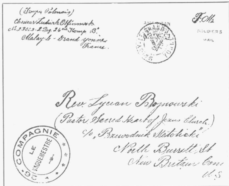
Another cover of soldier's mail from Gen. Haller's Army in France. The army consisted not only of Poles from France, but also from Italy, U.S., Canada, Brazil and Argentina. In 1918 about 21,000 soldiers from U.S. and Canada arrived in France.

Polish battlefronts. And today the Haller Veterans Post No. 111 is one of the largest of its kind in the United States. His wonderful achievements were not limited to New Britain only. In New York he established a Home For Girls and Women. In 1925 he founded St. Lucian's Home for the Aged.